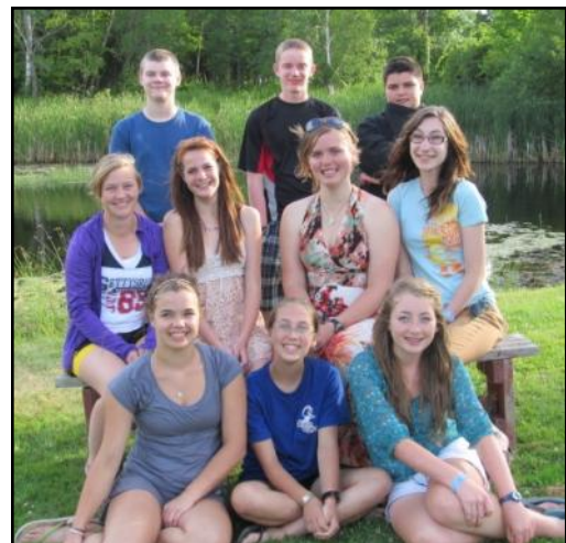
LTP Class of 2013

This will be our 8th year we have offered our LTP Camp training program. This program has been very successful in preparing young teens to become servant leaders.