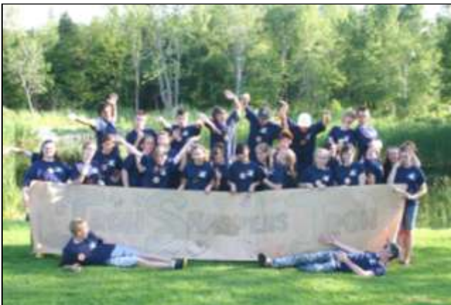
Our great 2011 Summer Staff

Staff applications are now available at our web site at www.MillStream.ws/opportunities . If you are looking for a rewarding summer by enriching children's lives, building new relationships and growing closer to God while being outdoors enjoying His creation (and having some fun!), then this is where you need to be!