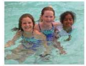
Warmer memories from summer at the pool during Trekkin' Camp 06

Please take a few minutes to read through the remainder of this newsletter to enjoy the blessings and challenges that God has bestowed upon the camp.