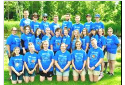
Mill Stream 2017 Summer Staff