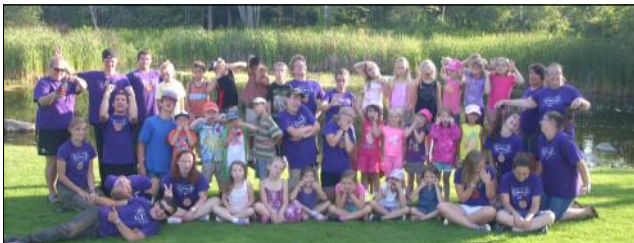
2013 Beginnin' Camp

Each camp was fun, encouraging and successful. Our program staff created an exciting summer program that was interesting and at times very unique. Our Beginnin' Camp is in it's 5th year with many new campers as several of our previous Beginnin' campers graduated into Trekkin' Camp this year and experienced a full weeklong session of camp.