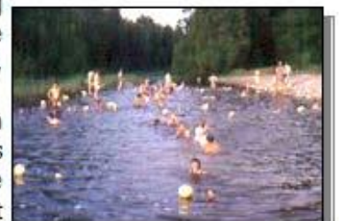
Swimming in Pigeon River in the 60's

If you are interested in becoming involved in this new endeavor, please contact us at alumni@millstream.ws .