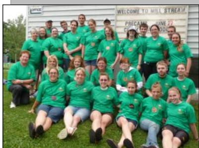
Our 2009 Staff Team

Staff: We are still in need of cabin leaders and assistant cabin leaders. If you are 16 years or older and feel called to be part of the summer staff at Mill Stream, please visit our website at www.MillStream.ws/opportunities.html for details and forms.