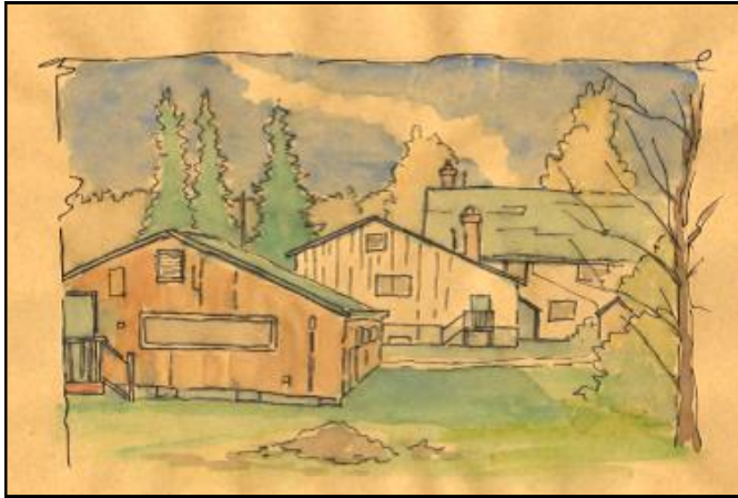
“Morning View” Watercolour painting by Ske7ch. This piece was painted from the perspective of the nurses cabin deck.